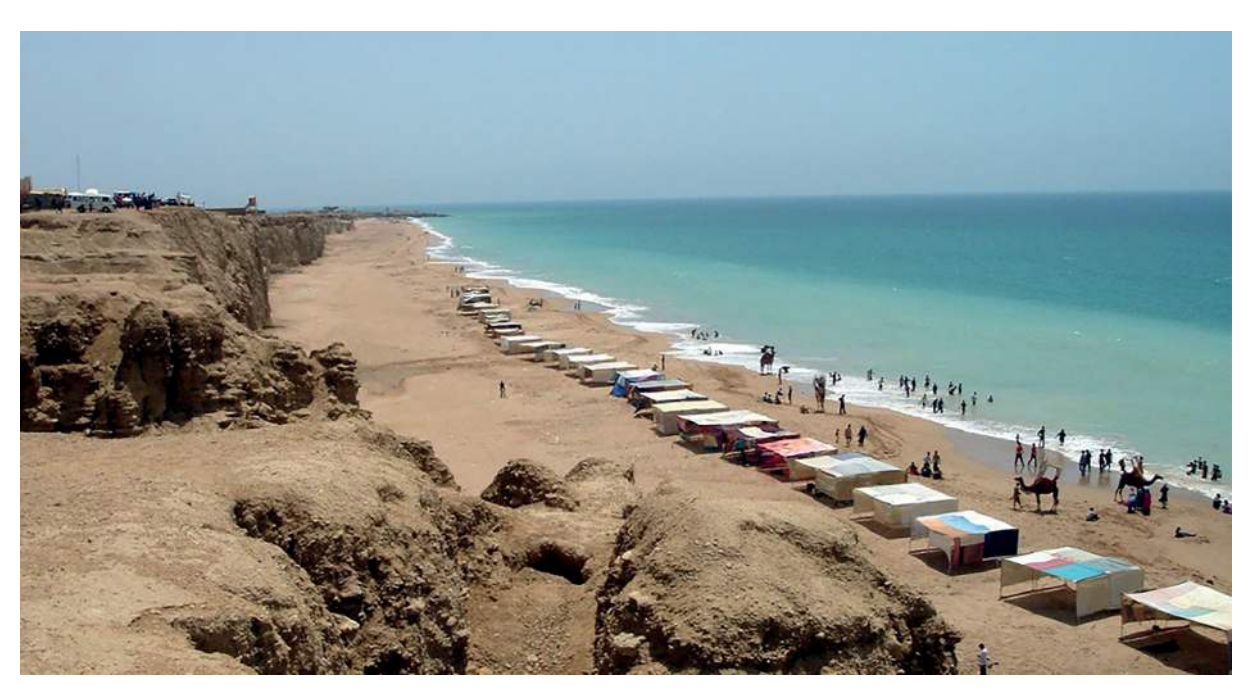
Fig. 4.3 for Question 4