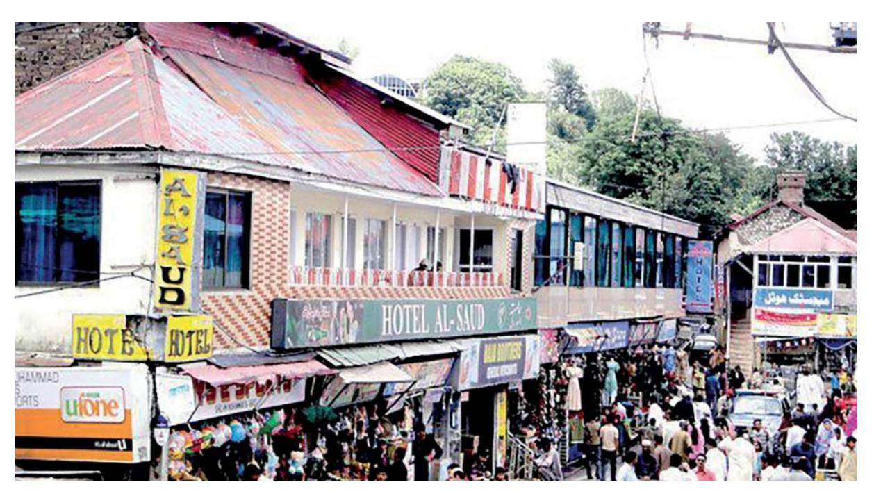
Fig. 4.5 for Question 4